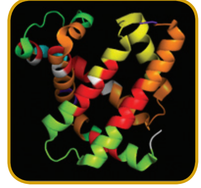
Deuterium uptake in lyophilized powders of myoglobin and sucrose (1:1 w/w, 43% RH, 5°C). ROYGBIV color scale indicates uptake from low (violet) to high (red).